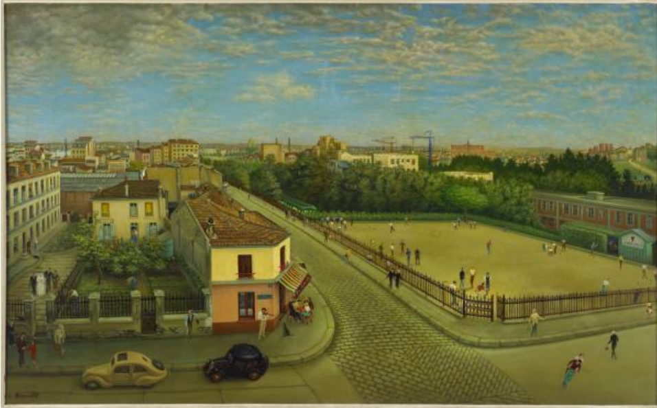
Pierre Arcambot, "From my window, corner of Régnauld and Château-des-Rentiers streets", 1955, oil on canvas