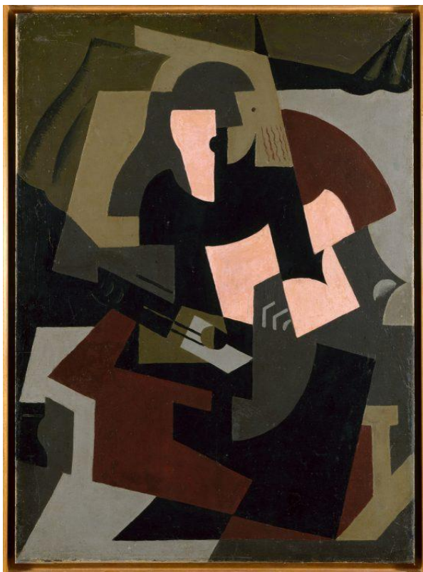
Maria Blanchard, “Woman with guitar”, 1917, oil on canvas