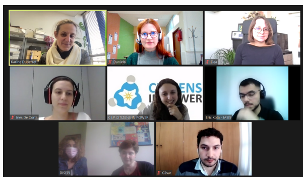
The POEME Partnership's monthly meetings

students with digital resources in order to improve second language acquisition. The POEME project also focuses specifically on digital, natural, tangible and intangible cultural heritage, by using these elements, in combination with innovative pedagogical practices and the improvement of digital skills, to advance the competences of educators and promote the integration of migrant students in their host countries.