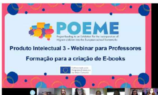
Still of Webinar organised by SPEL

The partners have organized a successful webinar for educators with the aim of providing them with the knowledge and skills needed to create interactive e-books. The software presented were Book Creator and Sigil. The Webinar was an opportunity to share strategies that can be used for planning and designing e-books, incorporating multimedia and interactive elements. E-books can also be used to facilitate and enhance student learning.